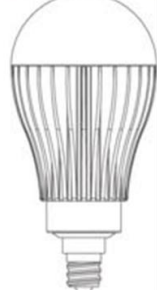
Ø 49.8 x 104 mm

Aeon Lighting Technology Inc. 16F-8., No.2, Jian 8th Rd., Zhonghe Dist., New Taipei City 235, Taiwan (R.O.C.) Tel +886-2-8226-1289 Fax +886-2-8226-9066 www.aeonlighting.com