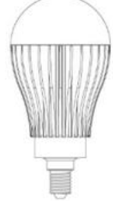
Ø 50 x 112 mm