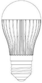
Ø49.8 x 105 mm Design B22D