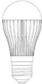
Ø49.8 x 108 mm Design E12 (US)