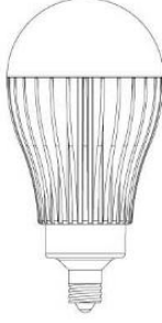
Ø49.8 x 99 mm Design E12 (EURO)