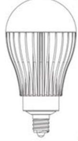
Ø 49.8 x 101 mm