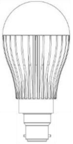
Ø 49.8 x 104 mm