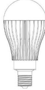
Ø49.8 x 105 mm